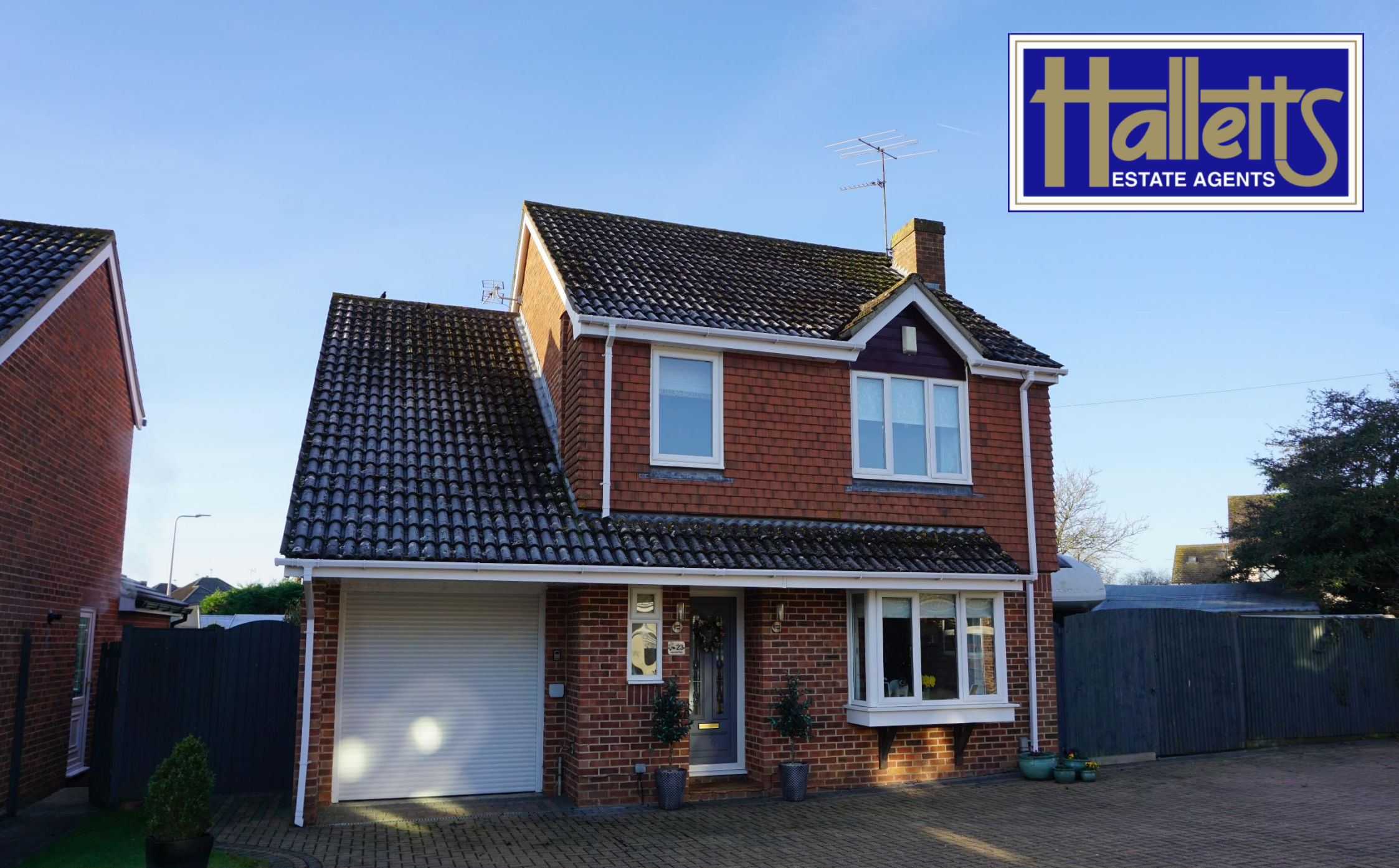
23 Agricola Way Thatcham Berkshire RG19 4GB